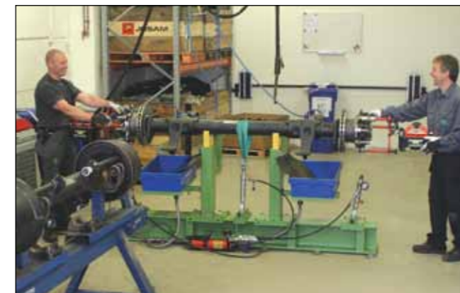
CAAC. Axle adjustment with decisive benefits.

CAAC means "Computer Axle Adjustment Concept". Through CAAC the measurement is done