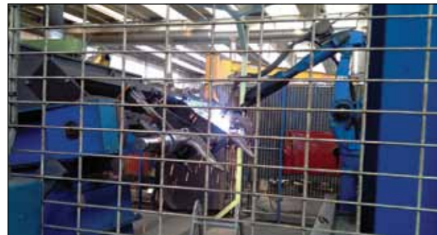
The Robot Line by Assali Stefen

After the financial crisis, Meritor decided to withdraw from the European market for trailer axles. For more than 25 years, Assali Stefen in Italy has produced steerable axles for Meritor. Now, under licens, Assali Stefen takes over and continues the axlesproduction at their modern production facilities.